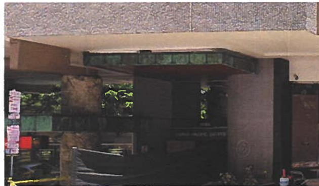
* Photo of the current site