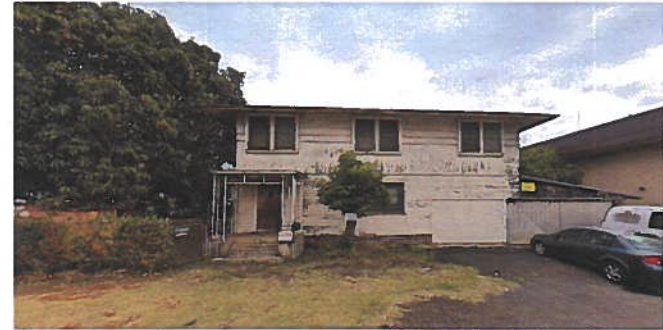
* Photo of the current site