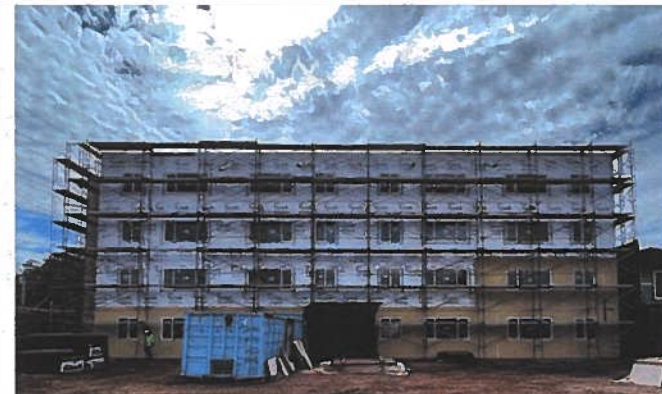
* Photo of the current project