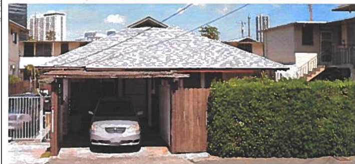
* Photo of the current site