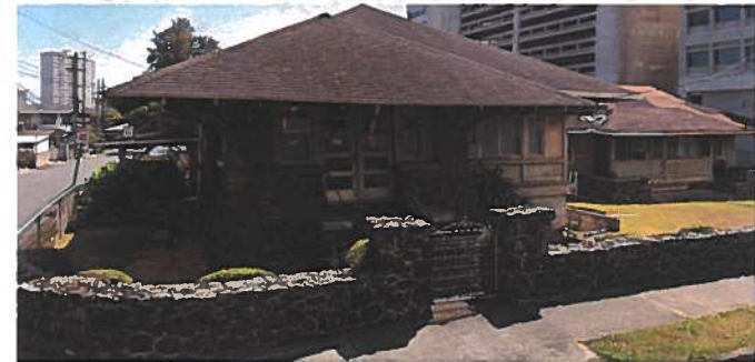
* Photo of the current site