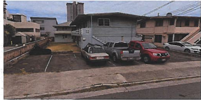
* Photo of the current site