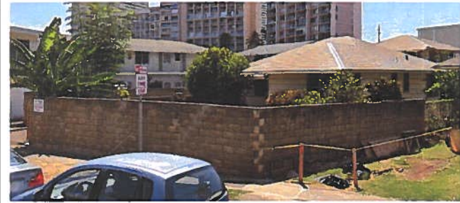
* Photo of the current site