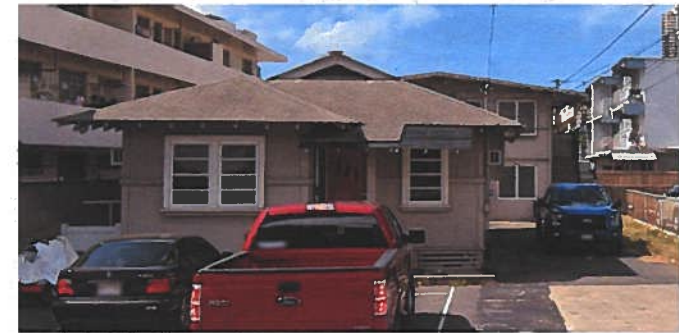
* Photo of the current site