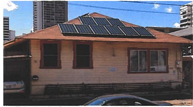
* Photo of the current site