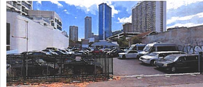
* Photo of the current site