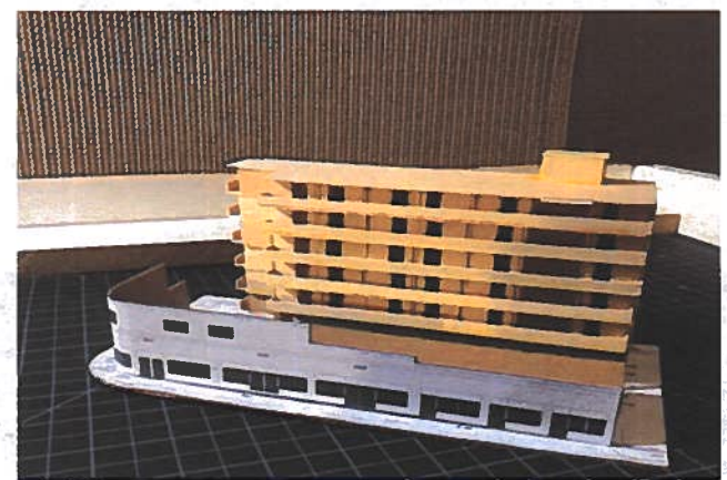
* Rendering image