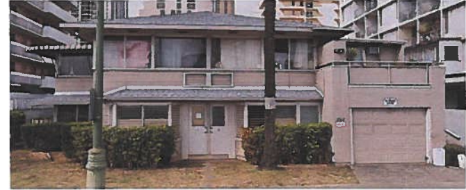
* Photo of the current site