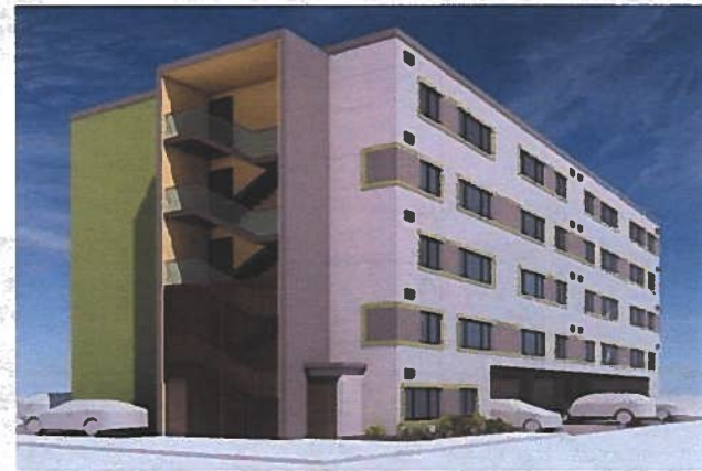
* Rendering Image