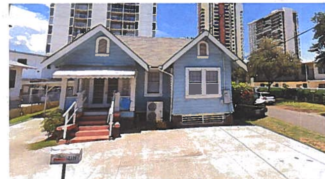
* Photo of the current site