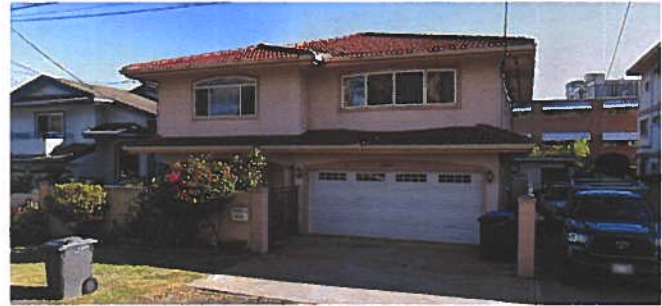
* Photo of the current site