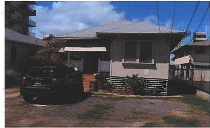
* Photo of the current site