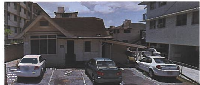
* Photo of the current site