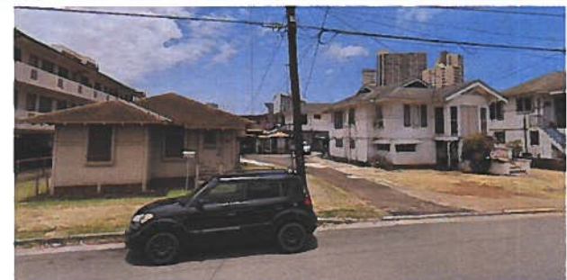
* Photo of the current site