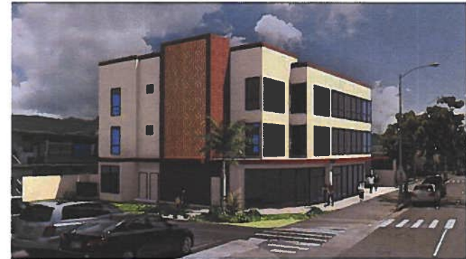
* Rendering Image