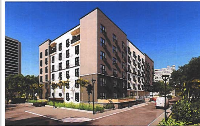
* Rendering Image