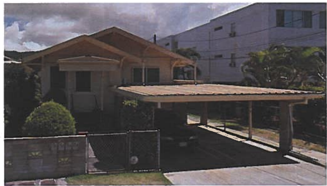
* Photo of the current site