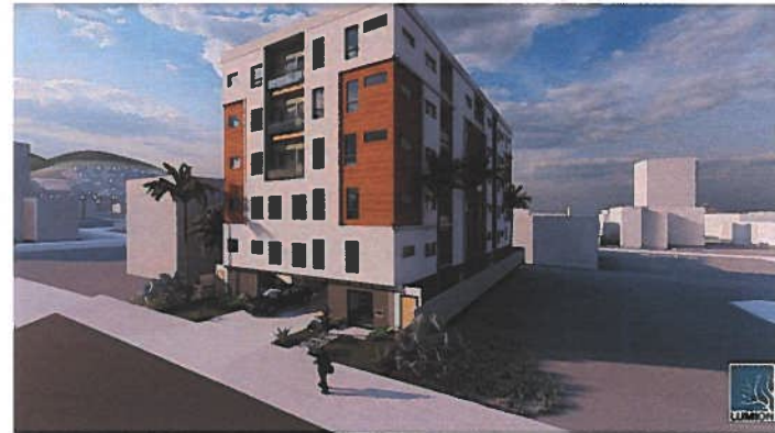
* Rendering Image