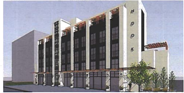
* Rendering image