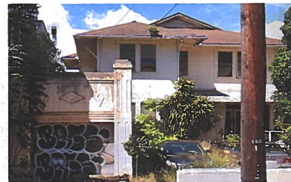
* Photo of the current site