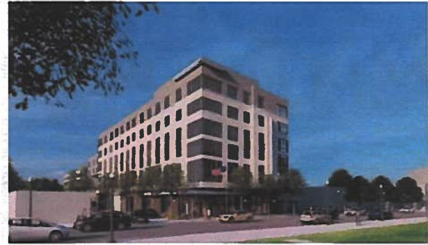
* Rendering Image