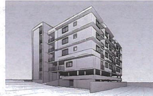
* Rendering Image