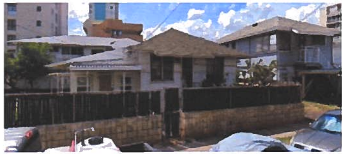
* Photo of the current site