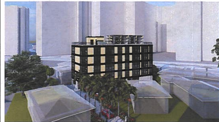
* Rendering Image