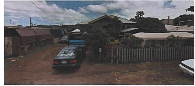
* Photo of the current site