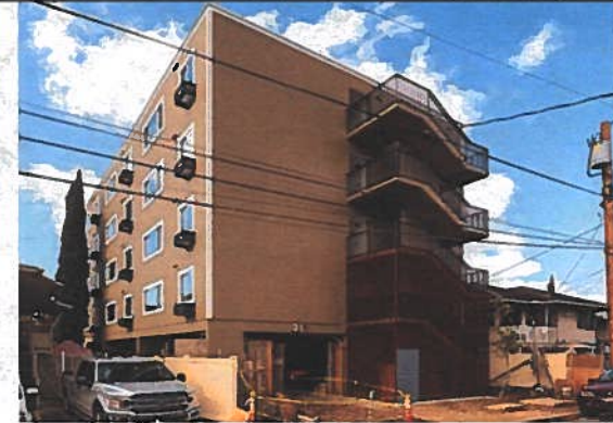
* Photo of the current project