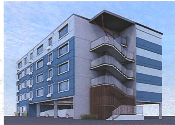
* Rendering image