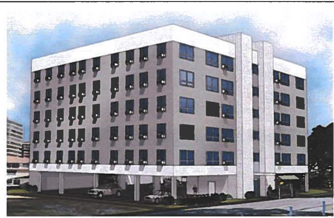
* Rendering Image