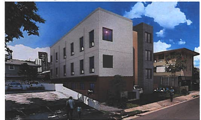
* Rendering Image