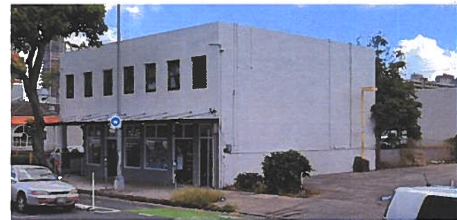
* Photo of the current site