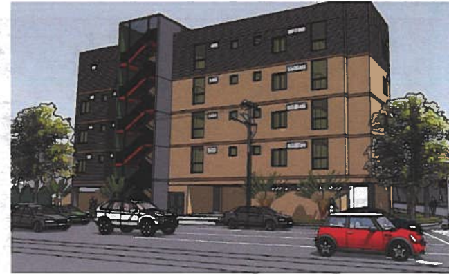
* Rendering Image