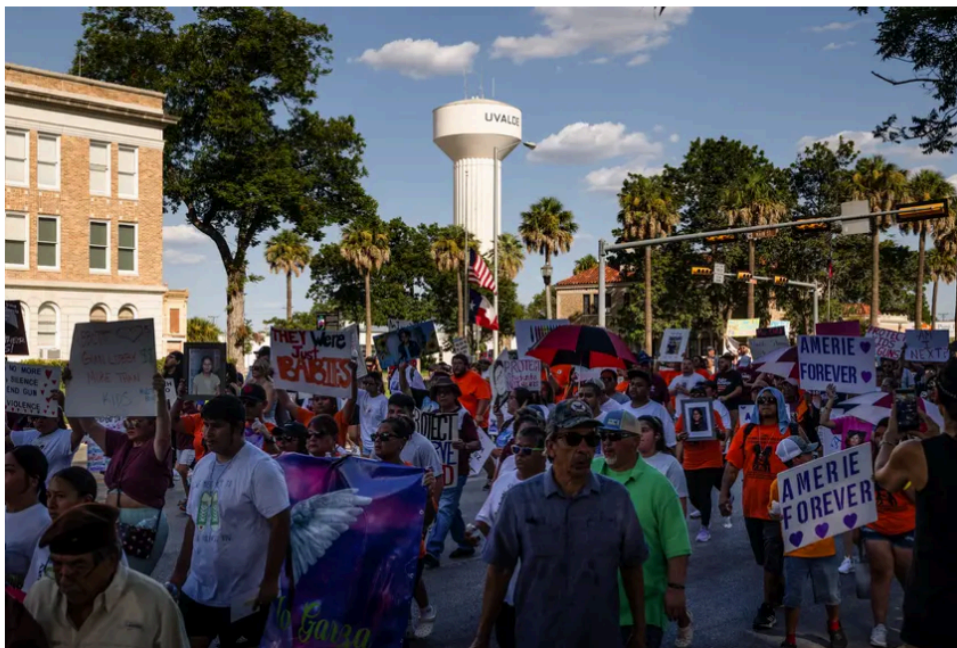
Family members and friends participate in a march in Uvalde on July 10, 2022, in support of those killed and injured in the school shooting at Robb Elementary.