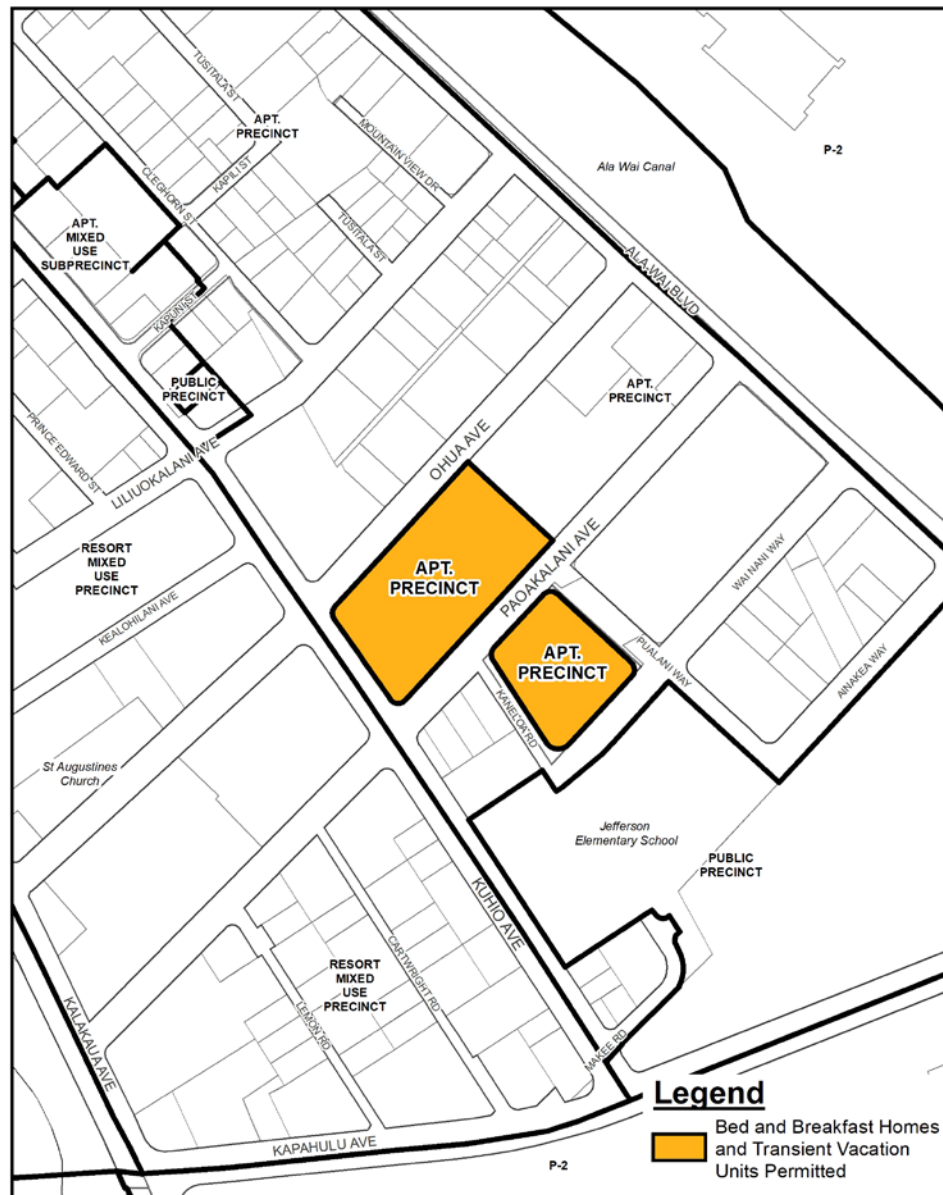
Figure 21-5.1 Bed and Breakfast Homes and Transient Vacation Units Permitted Areas – Waikiki Special District Mauka of Kuhio Avenue