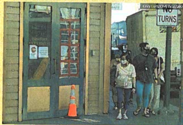
The shattered window at the entrance to the Honolulu Police Department's Chinatown substation is perhaps the most troubling sign of increasing vandalism in the community

But he says the number of cases in 2020 was atypically low due to Covid-19 emergency restrictions that kept people out of public spaces.