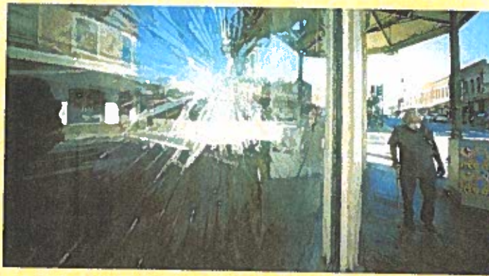
On Nuuanu Avenue, Black Cat Tattoo's large window was shattered last year. Business owners are having trouble getting replacement glass due to supply chain shipping problems.

But with the uncertainties of the pandemic, not many entrepreneurs are eagerly jumping in to start new businesses in Chinatown, especially in its current degraded condition.